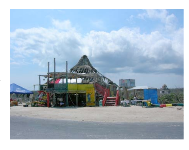
Tourist restaurant in Cozumel (Mexico) destroyed by a hurricane.

Adaptation to climate change and variability can take several forms: technical, managerial, behavioral and educational. Tourism adaptation measures often involve new product development, infrastructure management, environmental protection measures, marketing, and risk reduction. These can occur at all levels, from individual businesses to destinations and regions (examples are shown in Table 1). A good example of a business approach to climate-change adaptation is the International Civil Aviation Organization briefing paper for airports. The purpose is to prepare airports for