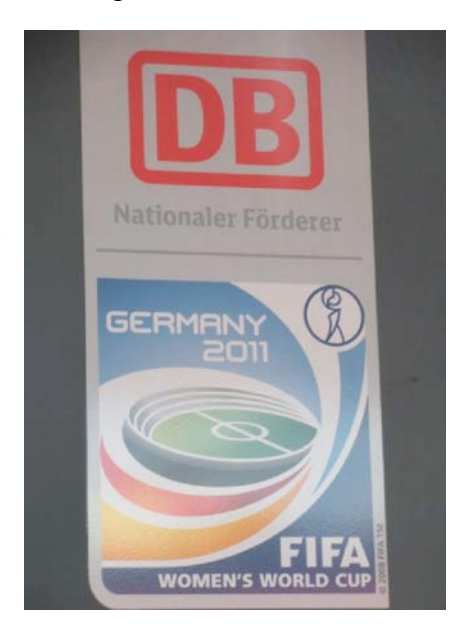
Deutsche Bahn was a sponsor of the Women's World Cup in 2011, also offering attractive "weltmeister bahncards" with a 25% discount on all train travel.

There are a large number of other examples of tourism businesses mitigation actions. The Dutch Railways, for example, found that the optimization of their brake energy recuperation settings saves them about 1% of total electricity use. The Deutsche Bahn is involved in a number of "low-carbon" initiatives, including Fahrtziel Natur (train packages to 19 unique nature destinations) and attractive offers related to sports event (e.g. FIFA football events). Investments into electric vehicles have been made in Vietnam (in Hanoi), in Thailand (Green Island and Siaoliouciou). and hybrid cars are used in rental car fleets (e.g. Green Tomato, UK), and taxis (Green taxis, NZ). More examples of industry initiatives can be found in Becken and Hay (forthcoming) and also in Gössling (2011).