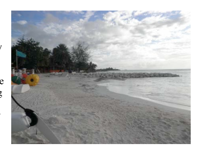
Beach protection (sea wall) in light colored rocks to reduce aesthetic disturbance (blending in with the white sand) at a beach resort in Antigua.

Another important area of climate-change adaptation relates to disaster risk reduction. There is some evidence that climate change will increase the frequency and intensity of certain hydrometeorological events (at least in some regions) and tourism destinations will have to prepare for crises and disasters resulting from such events. A number of good examples exist where tourism and disaster management have been integrated. Following the destructions of Hurricane Ivan, for example, Grenada has invested into a Policy and Operational Framework for Mainstreaming Disaster Risk Reduction into the Post-Hurricane Ivan